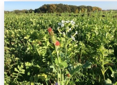
Clover and Radish